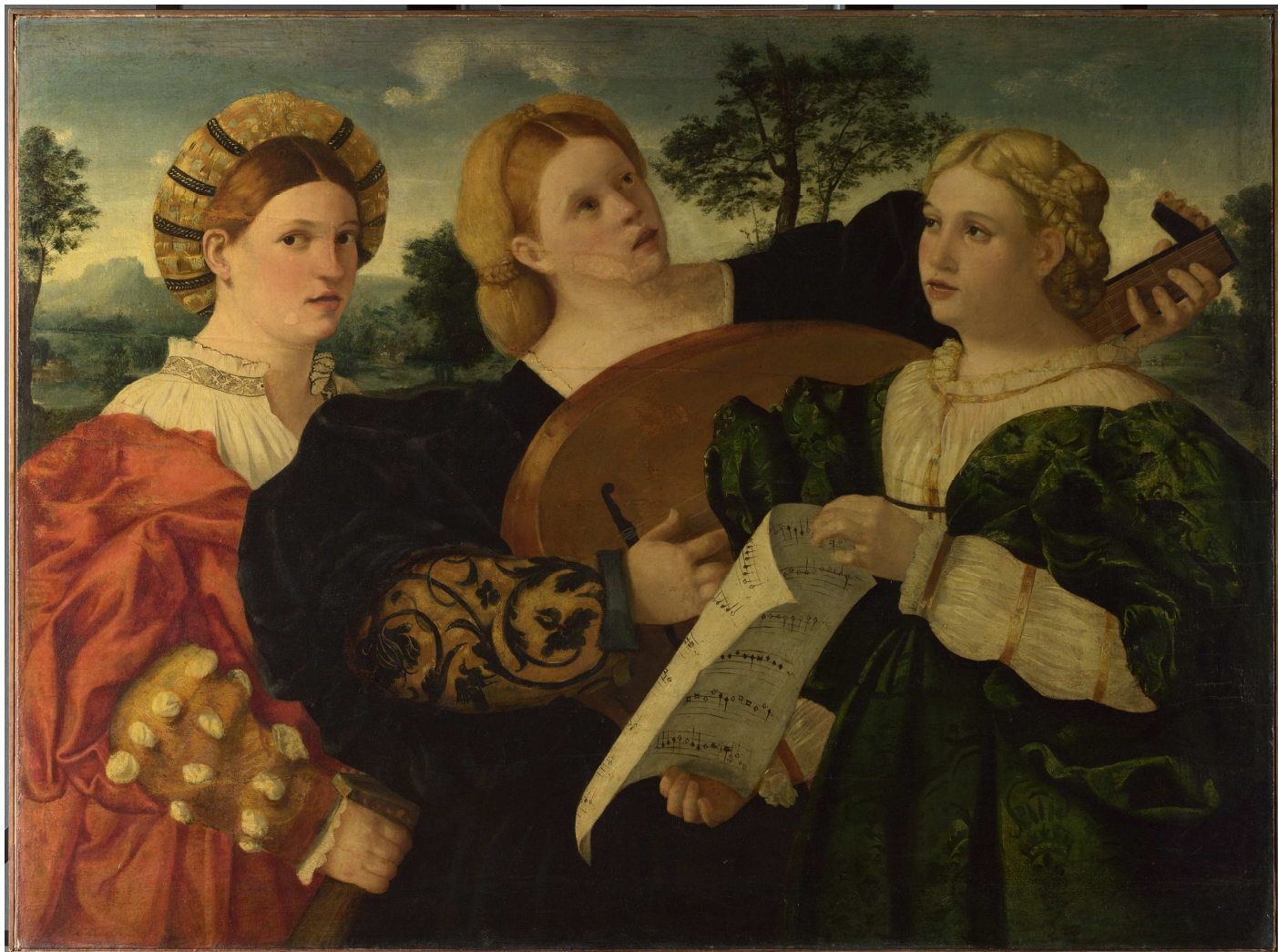
A Concert (Venetian, mid-1520s)

Intensive week-long courses on Baroque and Renaissance music, at Sidney Sussex College, Cambridge Supportive, friendly, uncompetitive, exhausting and fun!